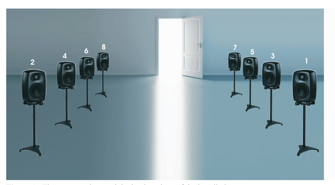
Figure 1. The entrance door and the loudspeakers of the installation.

The figure 1 above shows the basic idea how the sound installation should look like: The entrance door brings the audience in the middle of the installation. Note that the symmetry-line is in the center of the entrance pathway. Also the loudspeakers are symmetrically on both sides of the central line.